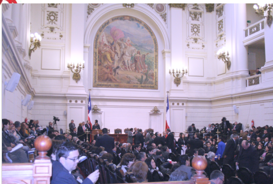
Beautiful Congress hall built in the 1800's where the ceremony took place.

If you know of anyone who could loan me a car for that time it would be much appreciated.