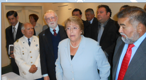
Michelle Bachelet with church leaders