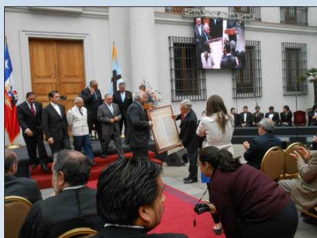
With the President of Chile

October 31, is the date of the Reformation, and the government of Chile has proclaimed this day to be a Protestant National Holiday. Chile is the first country in the world to have this holiday where most all the stores are closed. The day before the holiday we (the church leaders) met with the current President of Chile in the Presidential Office and gave him a plaque to hang in his office.