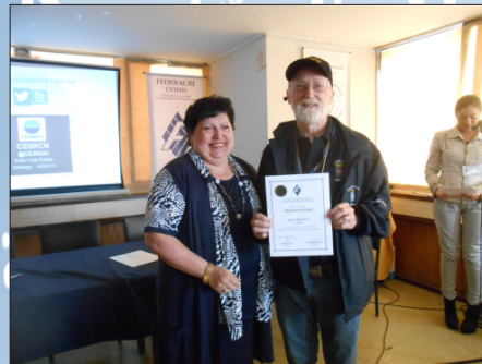
Receiving a certificate from the President of the Radio Federation